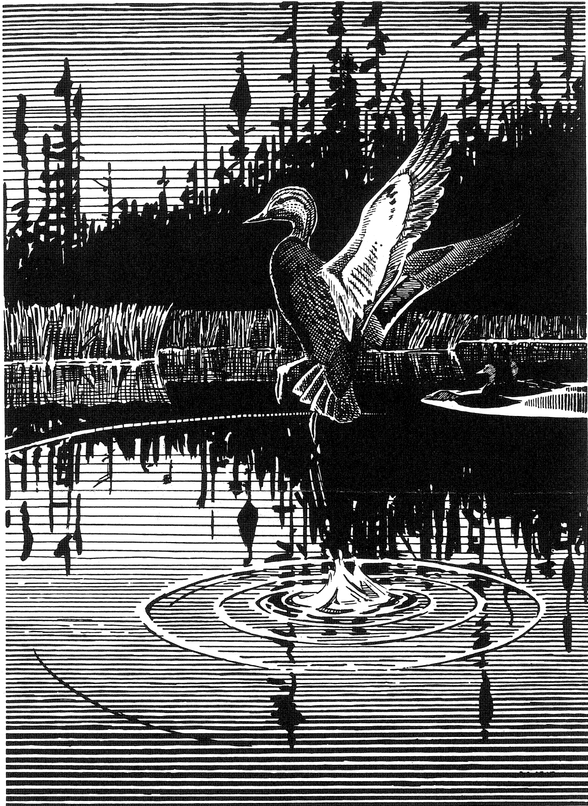
Illustration is by permission — in new Tufts Birds of Nova Scotia